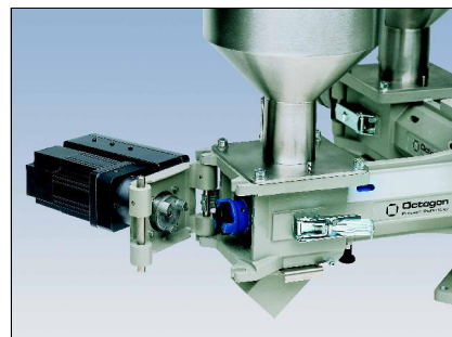
Dosing drive (open)