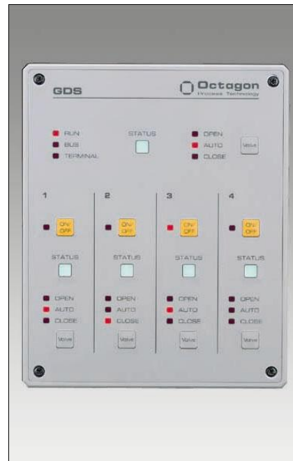
Dosing controller GDS