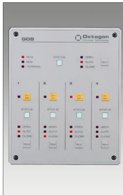
Dosing controller GDS