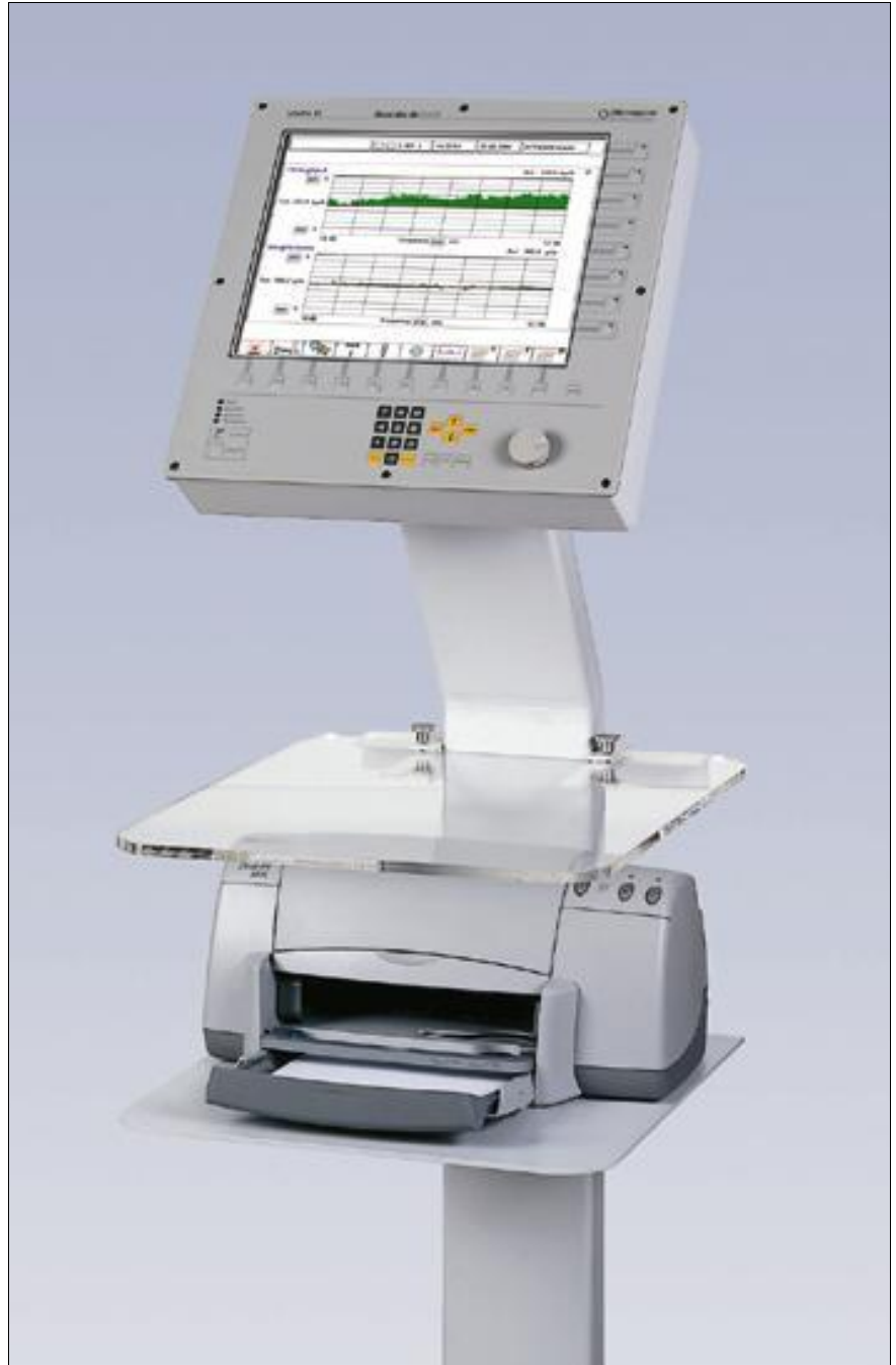
Visualisation VisEx C fitted to rack with connected inkjet printer

Simply by exchanging the software, the VisEx visualisation is easily adapted to different tasks. This allows the system to be extended with further Octagon measure and control modules at later stages.